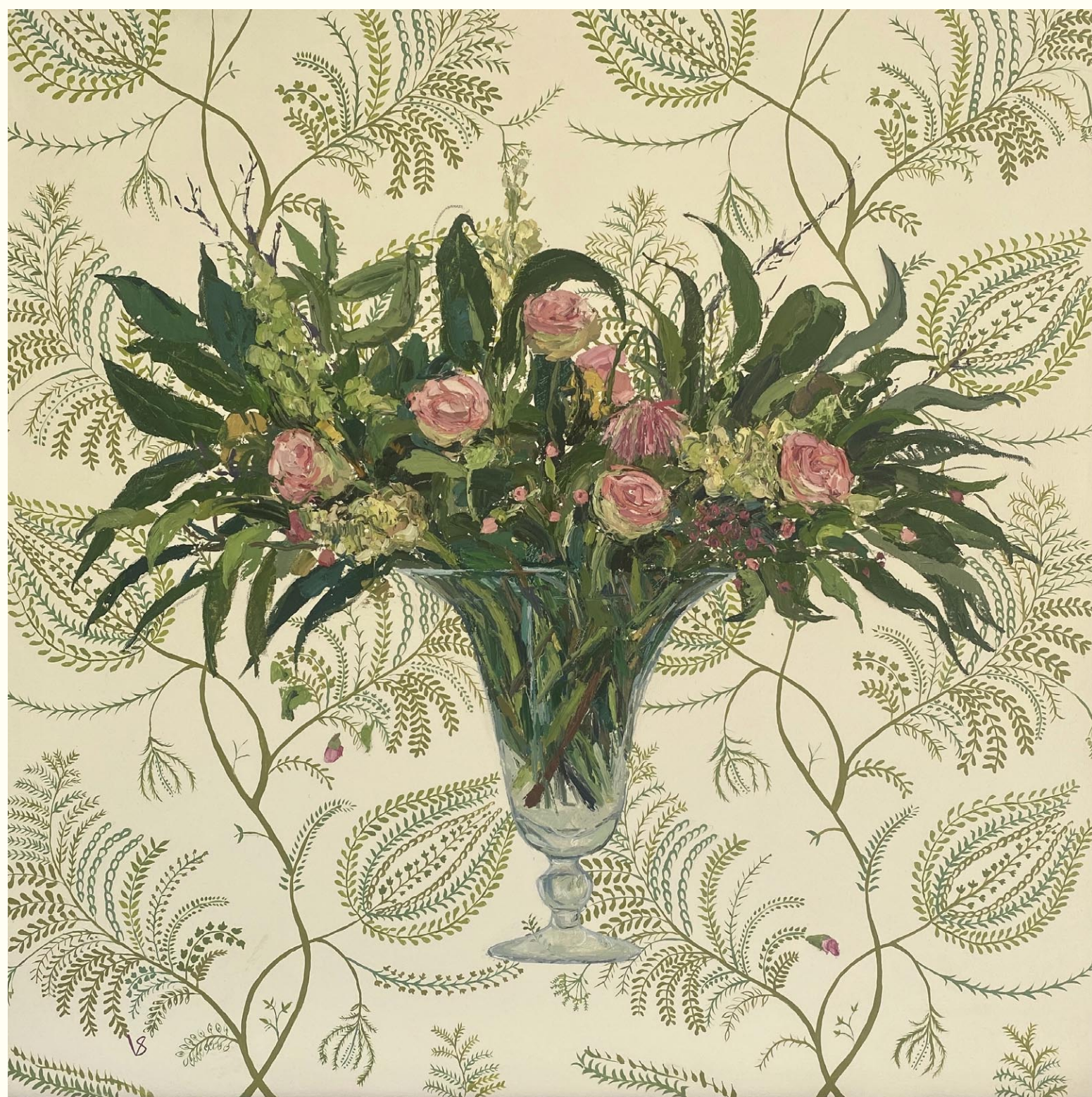
Venetia Syms, Palermo Flowers , oil on canvas, 90 x 90 cm