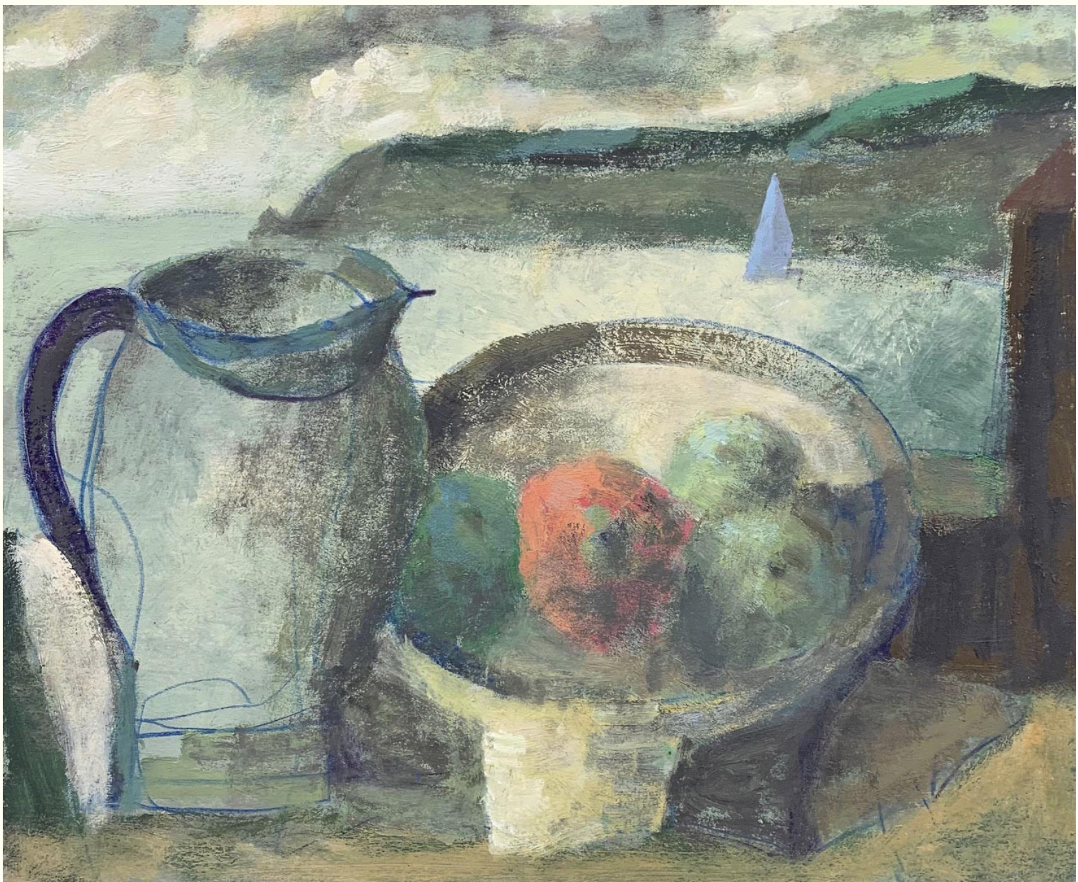
Nicholas Turner, Harbour with Fruit , oil on board, 25 x 30 cm