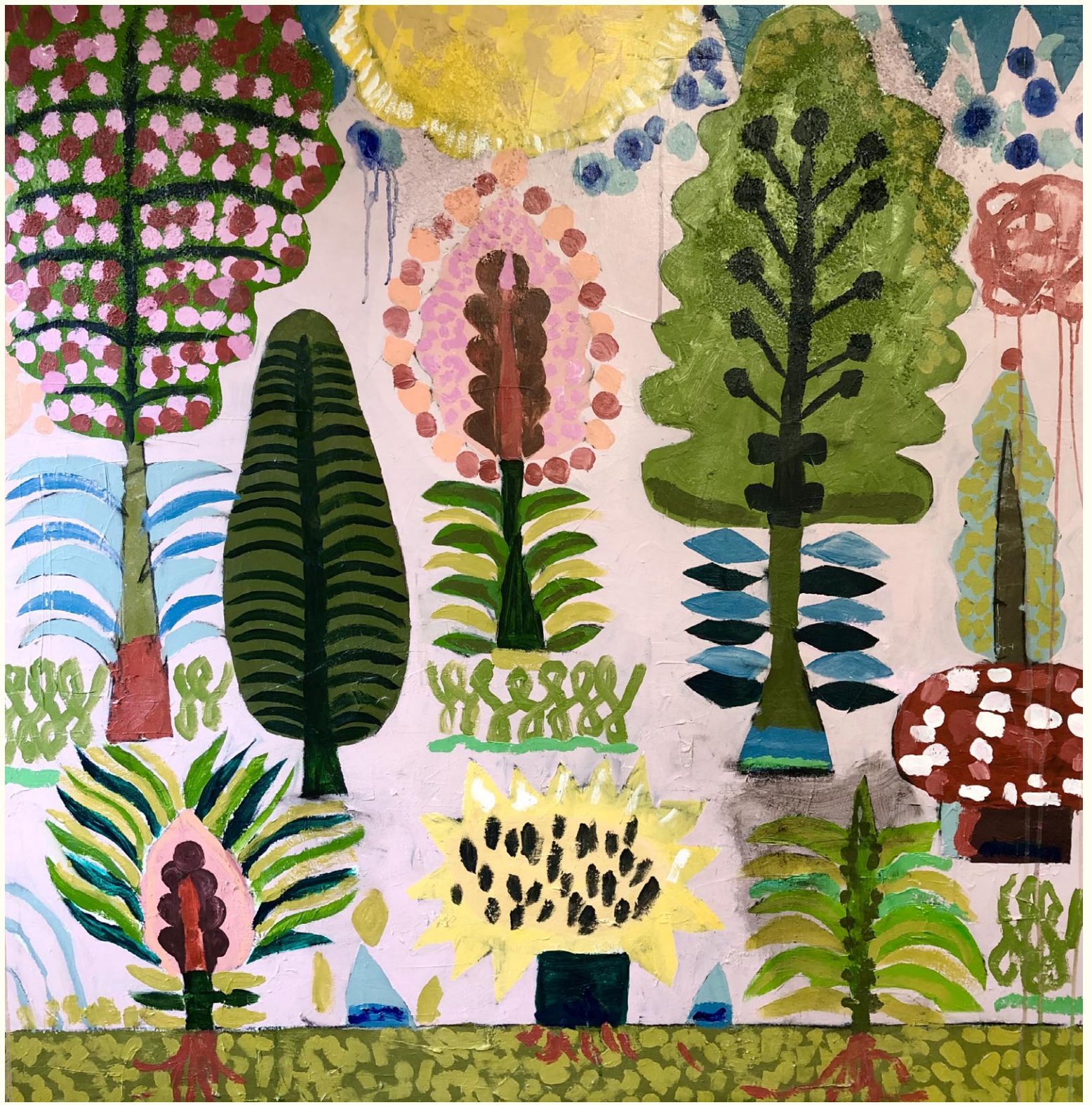
Cornelia O'Donovan, Spring , mixed media on canvas, 120 × 120 cm