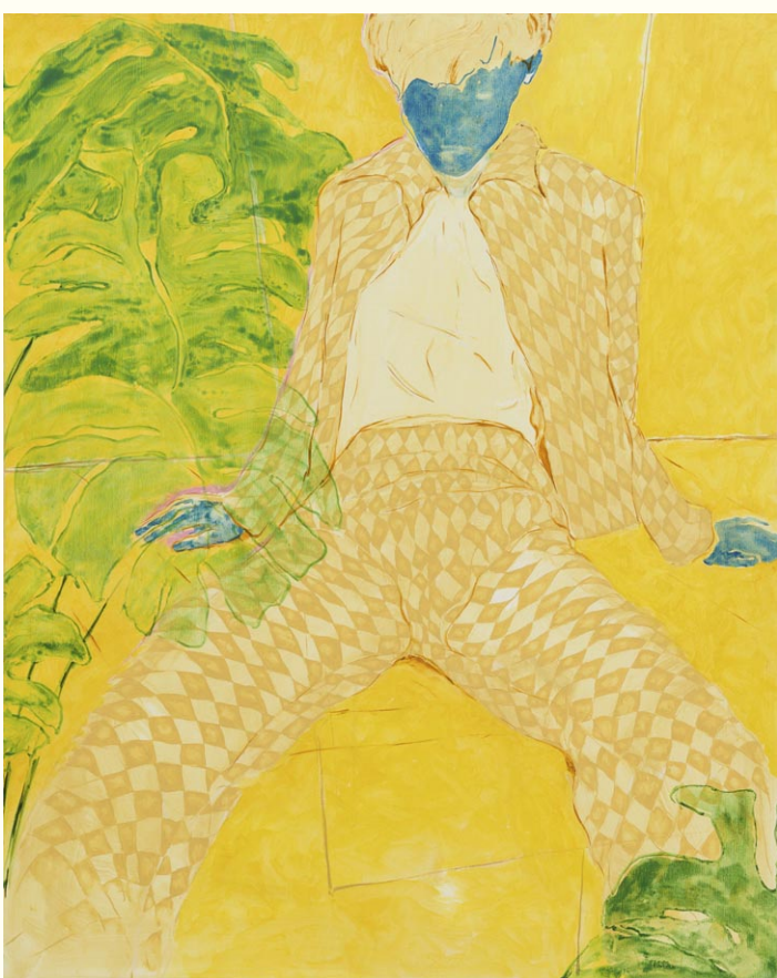
Shelly Tregoning, Peppermint Centre , oil on canvas, 120 × 100 cm