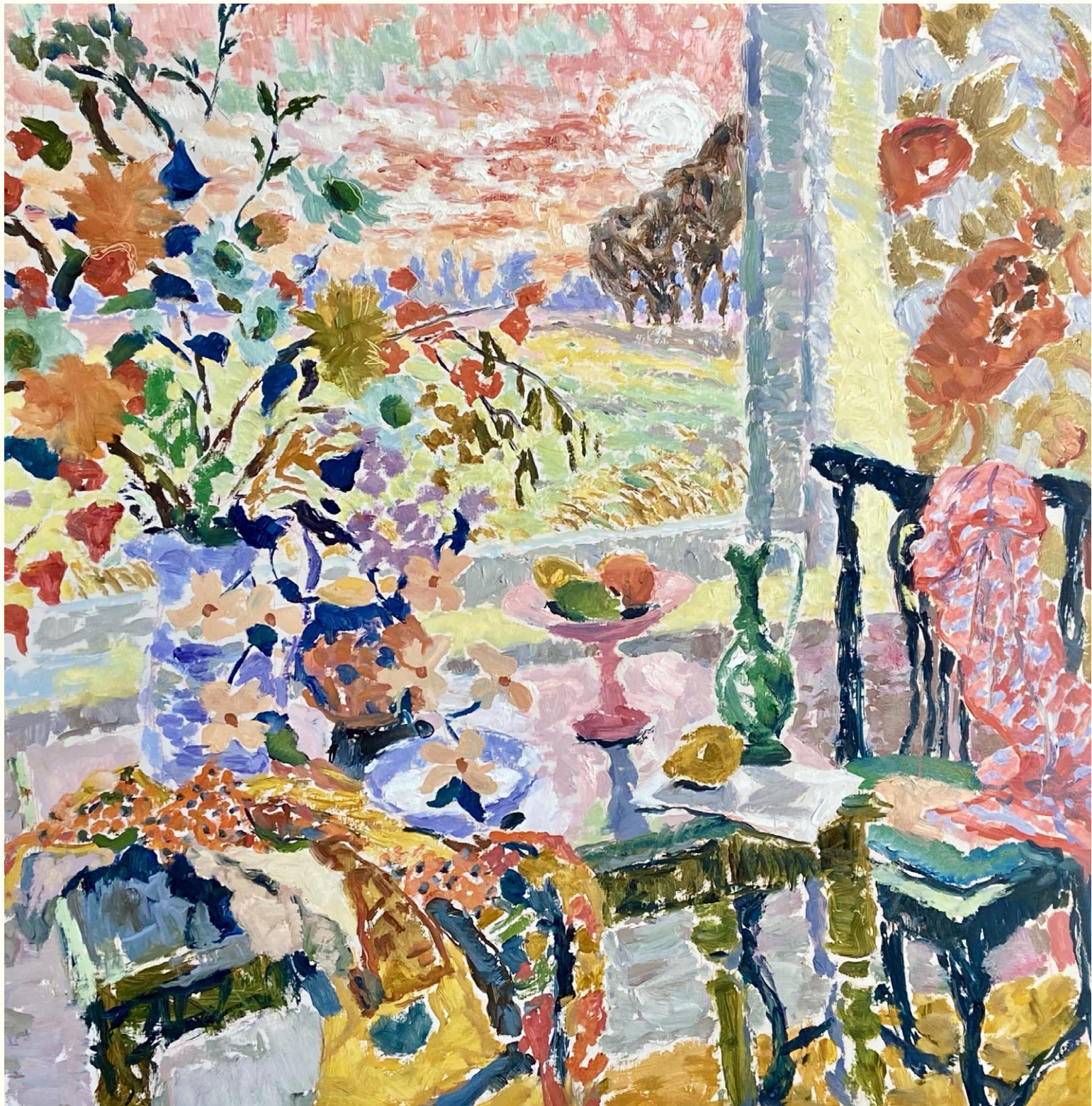
Hugo Grenville, Winter Sun , oil on canvas, 107 × 107 cm