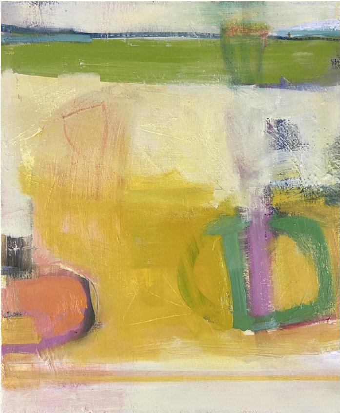
Trudy Montgomery On the Beach , oil on canvas, 61 x 51 cm