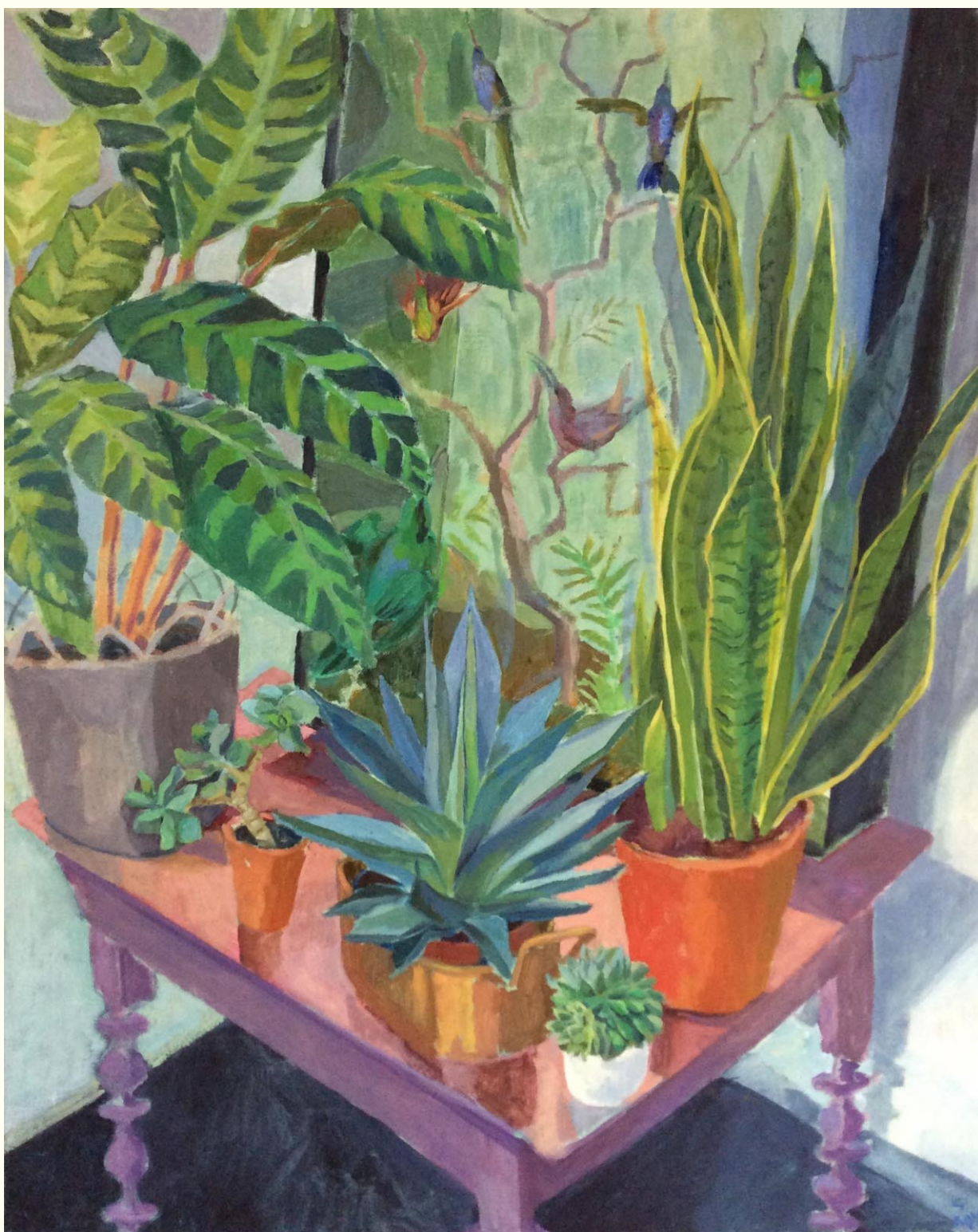
Stella Agnew, Small World oil on canvas, 76 x 61 cm