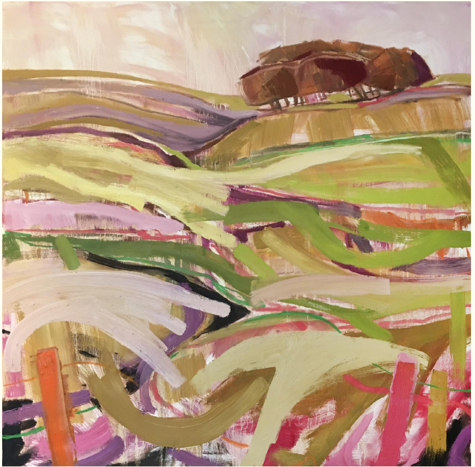
Emma Haggas, Beech Trees in Full Colour , oil on canvas, 100 × 100 cm