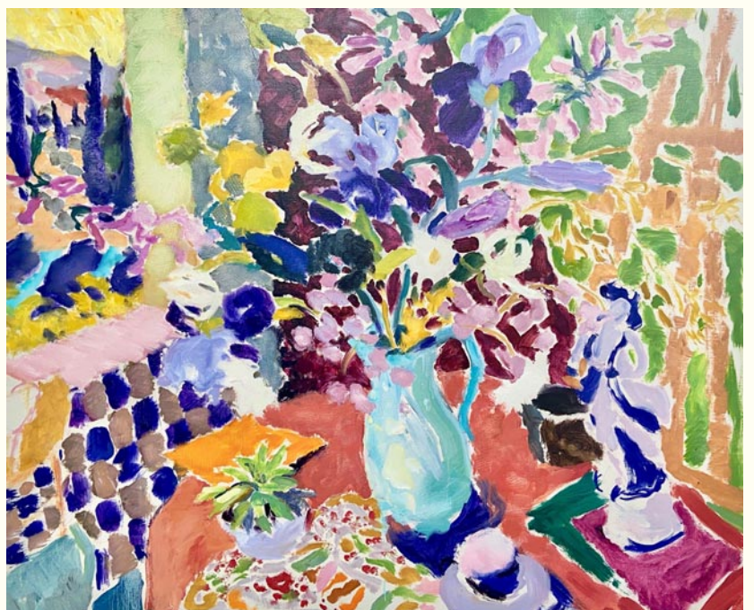
Hugo Grenville Memories of Pienza , oil on canvas, 96 × 120 cm