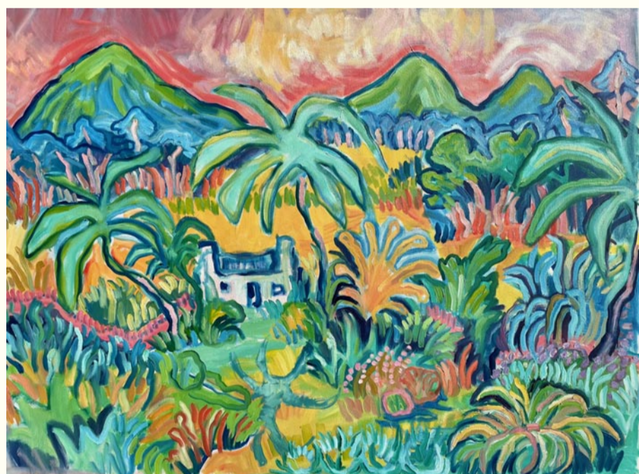
Holly Macdonald Maybe Wicklow , oil on canvas, 90 x 120 cm

Do follow us on Instagram: eastwoodfineartltd .