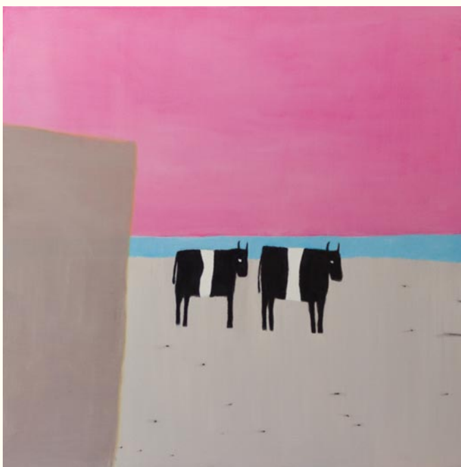
Andrew Squire 2 Cows on Beach , oil on canvas, 90 × 90 cm