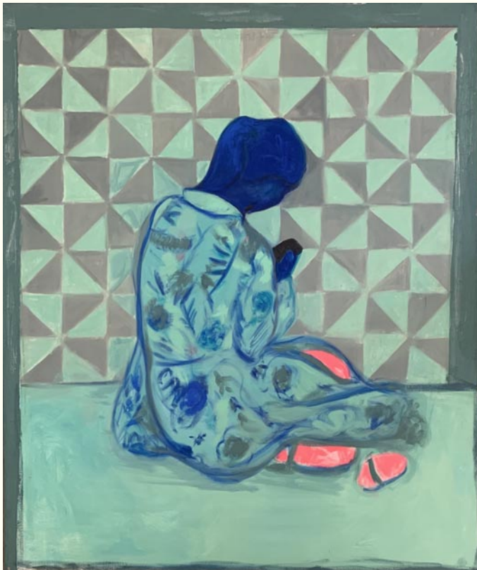
Jonathan Schofield Blue Figure , oil on linen, 150 × 125 cm