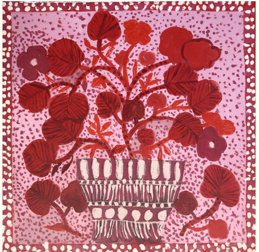
Cornelia O'Donovan Red and Pink , oil on canvas, 120 × 120 cm