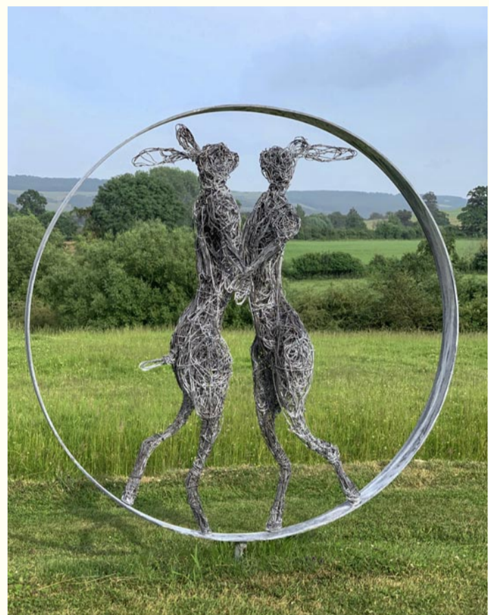
Rupert Till, Till we dance , metal, aged zinc finish, 1.2m h