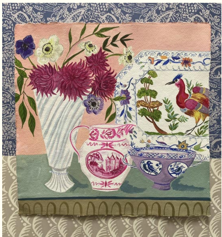
Emily Maude, The Porcelain Collector's Mantle gouache on hand-made paper, 30 x 30 cm